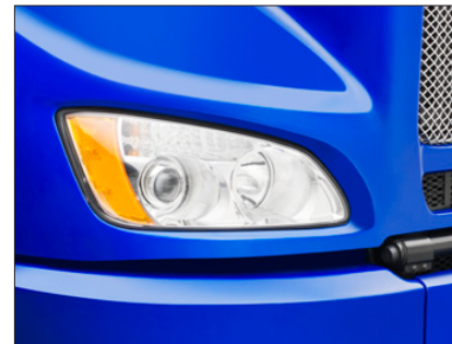
An advanced forward lighting system provides up to 30% more down-road coverage than conventional sealed beam designs. Choose the standard halogen or optional HID Xenon lamps.