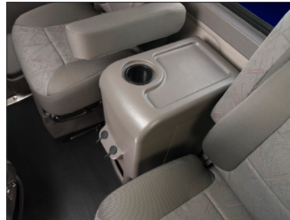
Optional center console with two power ports, cup holder and convenient storage makes the perfect in-cab workstation.