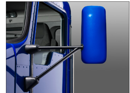
Heated and electronically-controlled aerodynamic mirrors minimize road spray, keeping visibility at a maximum.