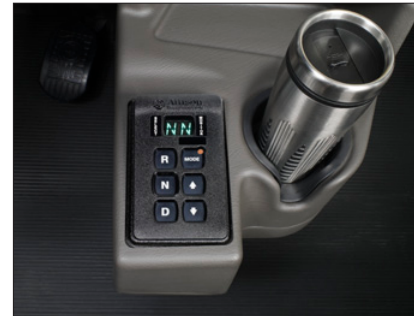
Easy-to-reach and operate dash control panel for Allison automatic transmissions. Also incorporates a handy cup holder.