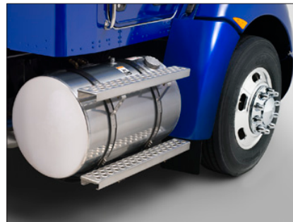
To add a distinctive look to your T440, Kenworth offers a wide variety of chrome and polished options. Polished aluminum wheels, fuel tanks and DEF tank covers are just few.