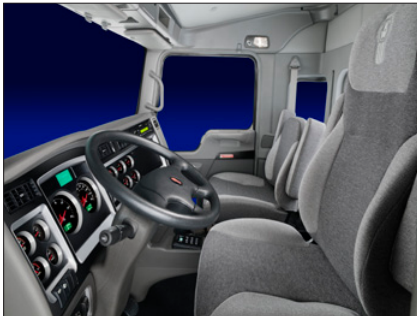
The fully-trimmed standard Summit interior shown with optional Kenworth Air Cushion Plus high back driver seat and Kenworth Toolbox Plus low back passenger seat.

Your T440 is available with plenty of job-specific and appearance options. Here are just a few of them.