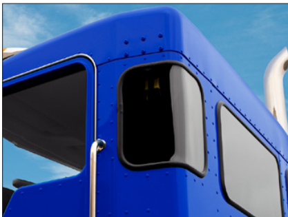
Cab corner windows greatly enhance visibility in tight places.